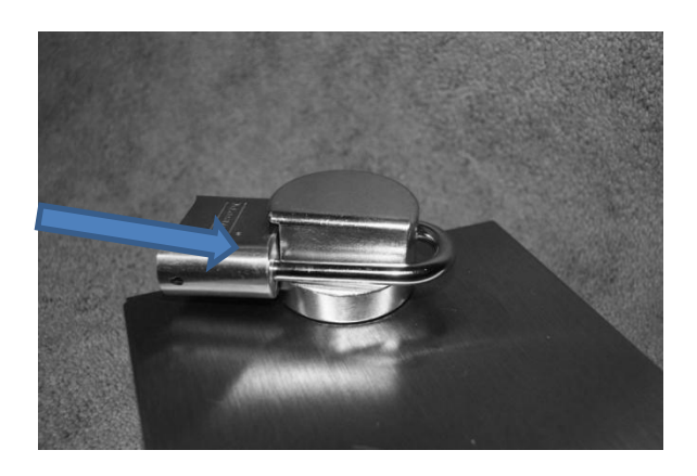
Step #8 Lock Master Lock.

Adjust Body of Master Lock so flat part of lock is horizontal. (parallel with top of A.G.L)